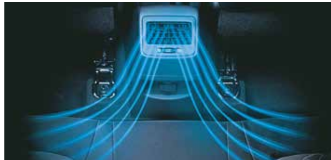
Rear AC Vent & Accessory Socket