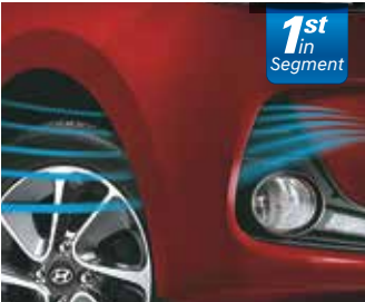
Front Air Curtains