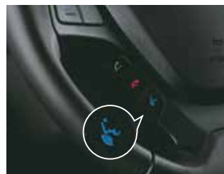
Voice Recognition Button on Steering