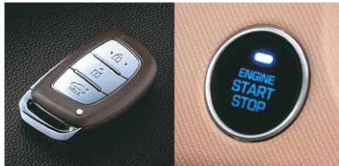
Smart Key with Push Button Start-Stop