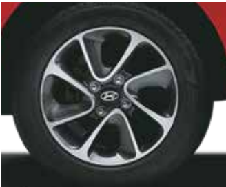
Diamond-cut Alloy Wheels