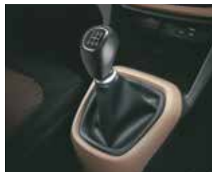
5-speed Manual Transmission

Experience power like never before with the state-of-the-art petrol and diesel engines of the GRAND i10.