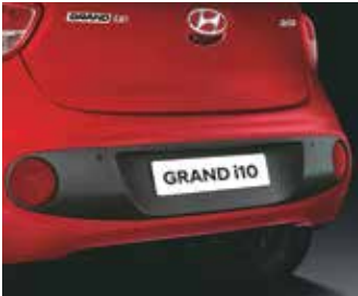
Dual Tone Rear Bumper