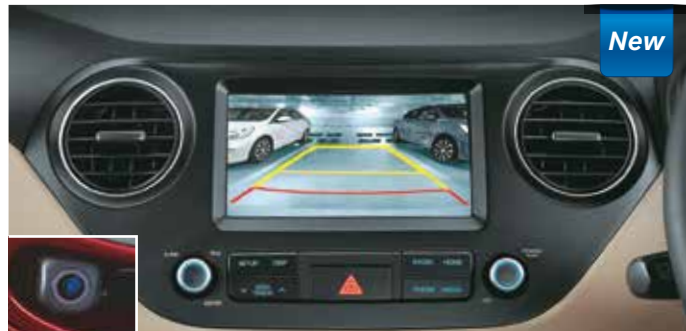
Rear Parking Assist System (with display on 17.64 cm Audio Screen)