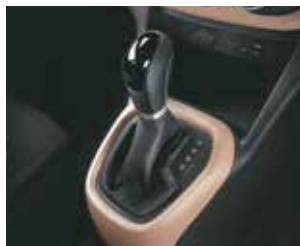
4-speed Automatic Transmission