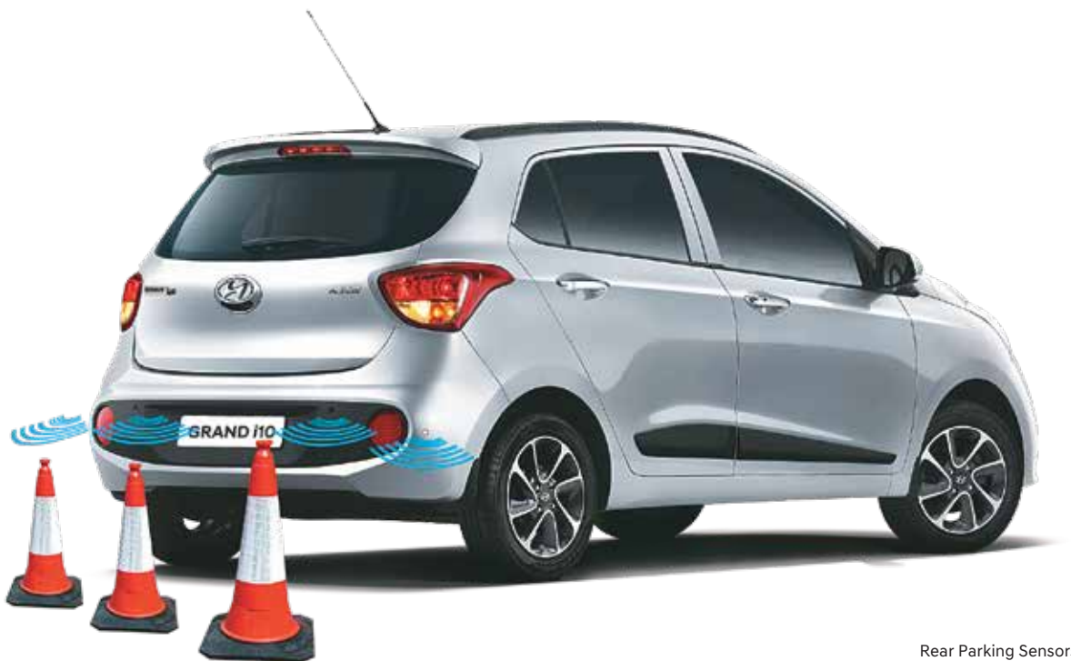
Rear Parking Sensors

The GRAND i10 offers unparalleled safety with advanced features like Dual Airbags, ABS with EBD ^ and rear parking assist system (rear parking sensors & rear camera).