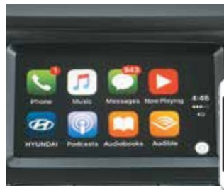
Apple CarPlay Connectivity