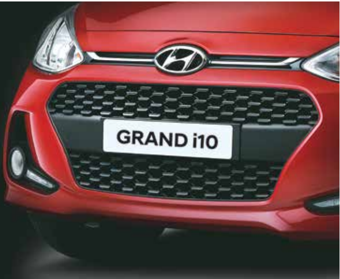
Cascade Design Grille - Bold New Design Identity