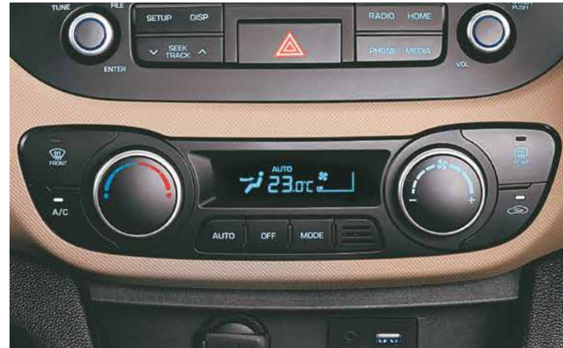
Fully Automatic Temperature Control

The GRAND i10 offers unparalleled safety with advanced features like Dual Airbags, ABS with EBD ^ and rear parking assist system (rear parking sensors & rear camera).