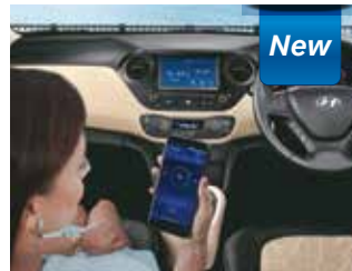
Hyundai iblue Smart Phone App for Audio Remote Control*