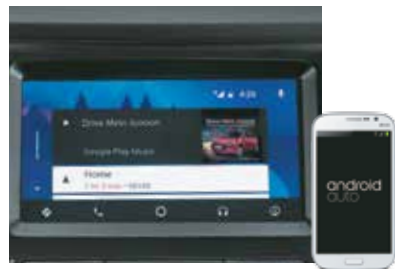
Android Auto Connectivity