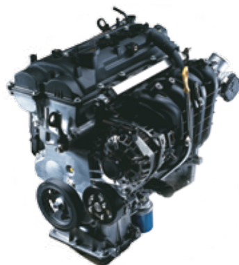
1.2L Kappa Dual VTVT Petrol Engine