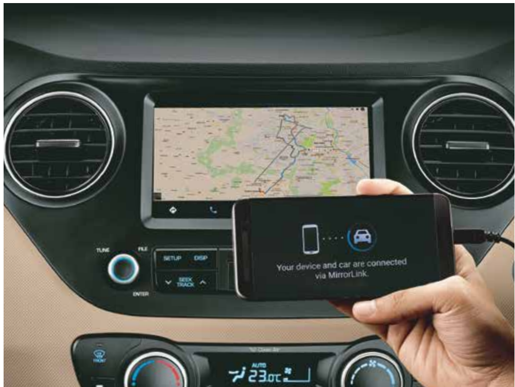
Mirror Link | Smart Phone Navigation

The GRAND i10 offers assistive technology at its very best with a class-leading 17.64 cm Touch Screen Audio Video System with smartphone connectivity, voice recognition and navigation support.