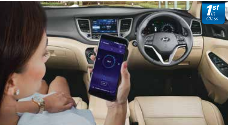
Hyundai Iblue Smart Phone App for Audio Remote Control*

Experience a smarter drive with the 1 st -in-class 20.32 cm infotainment system with smartphone connectivity and voice recognition.