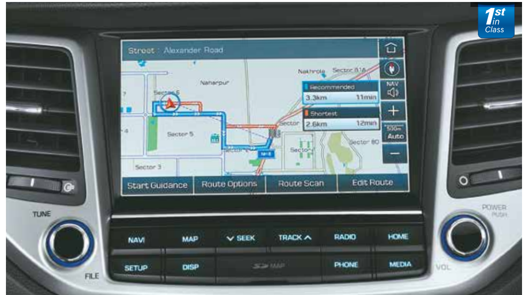
20.32 cm Smart HD Audio Video Navigation with Voice Recognition