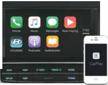
Apple CarPlay Connectivity