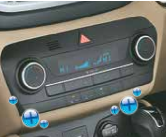
Dual Zone FATC with Cluster Ionizer