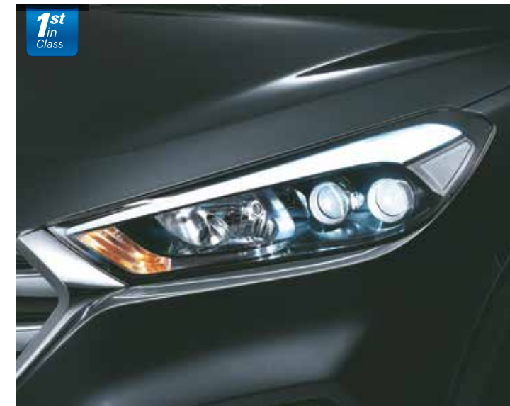
Dual Barrel LED Headlamps