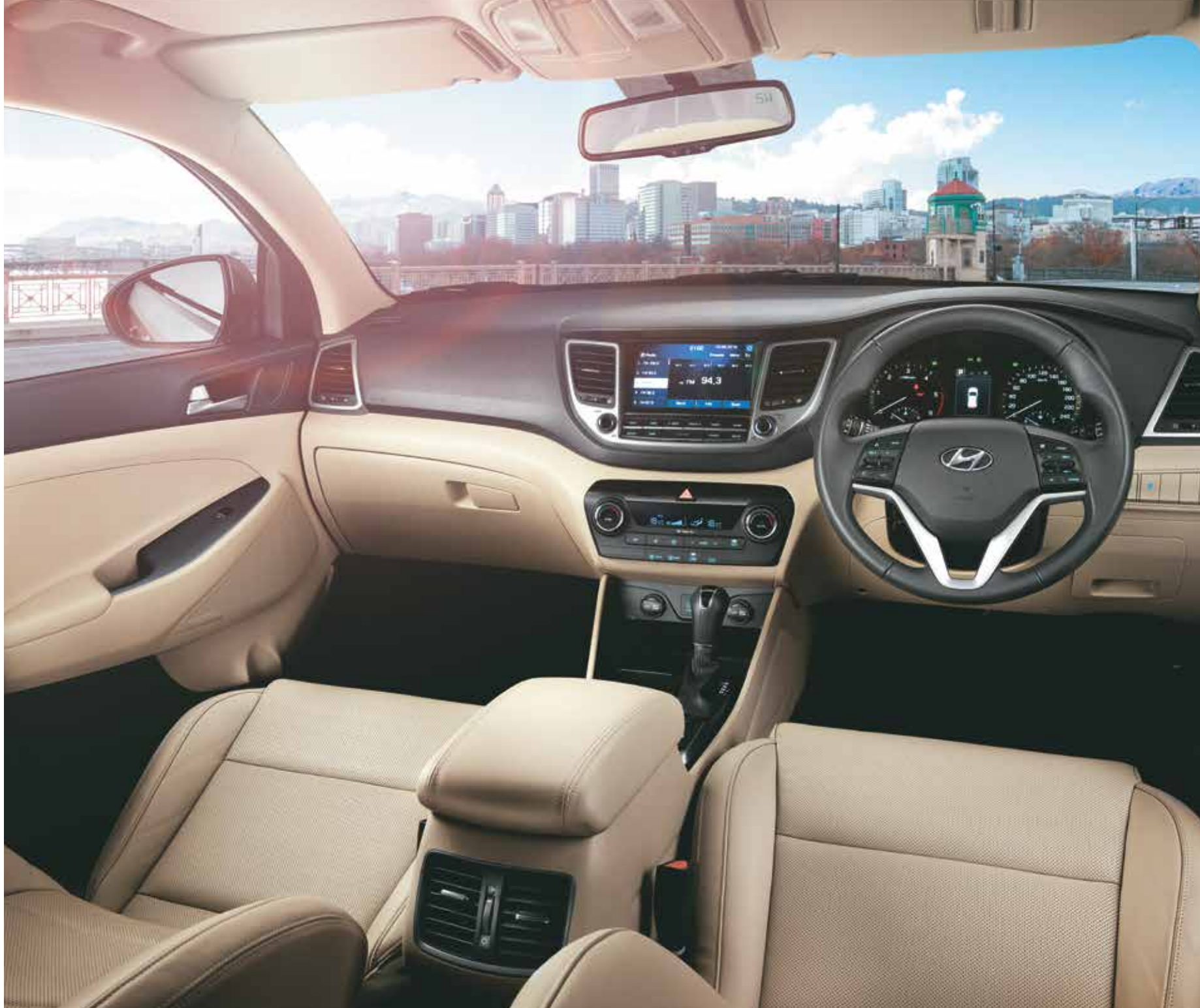
▲ 2 Tone Beige and Black Interiors