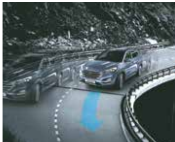
ESP with VSM