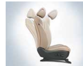
10-way Adjustable Power Driver Seat