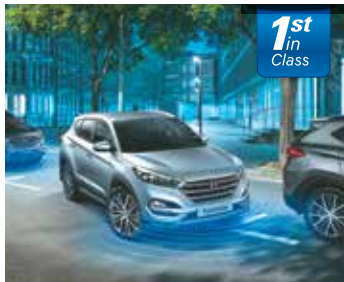
Front & Rear Parking Assist System