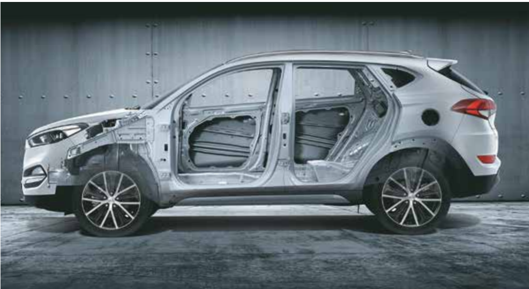
Strong structure with 51% Advanced High Strength Steel

Setting a new benchmark in all round safety, the TUCSON is specially designed with a host of class-leading active and passive safety features.