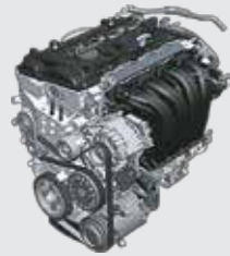
Nu 2.0L Petrol