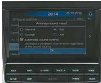
Arkamys Sound Mood