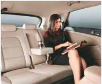
Premium Leather Seats