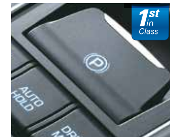
Electric Parking Brake