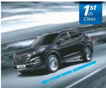
Downhill Brake Control (DBC)