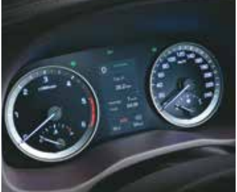
Advanced Supervision Cluster with Colour LCD Screen