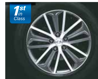
R18 Diamond-cut Alloy Wheels