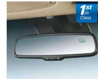
Compass on ECM