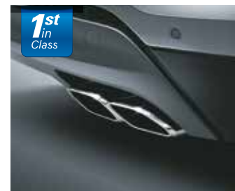
Twin Chrome Exhaust