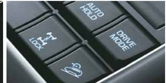
4WD Lock Mode

Get more out of every drive with the powerful Petrol & Diesel engines of the TUCSON. Weild the power to challenge all terrains with 4WD, and get unparalleled stability & driving dynamics each time you get behind the wheel.