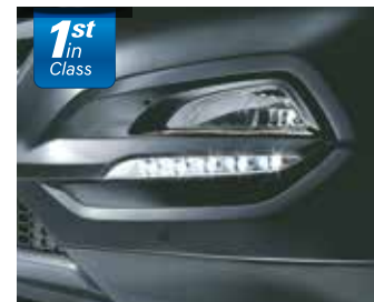
Fog Lamps with LED DRL