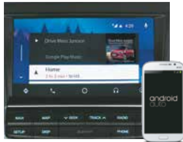
Android Auto Connectivity