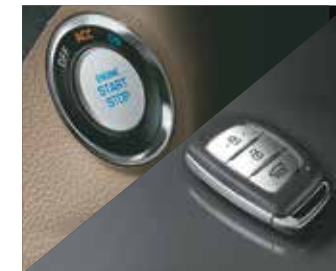
Smart Key and Push Button Start/Stop